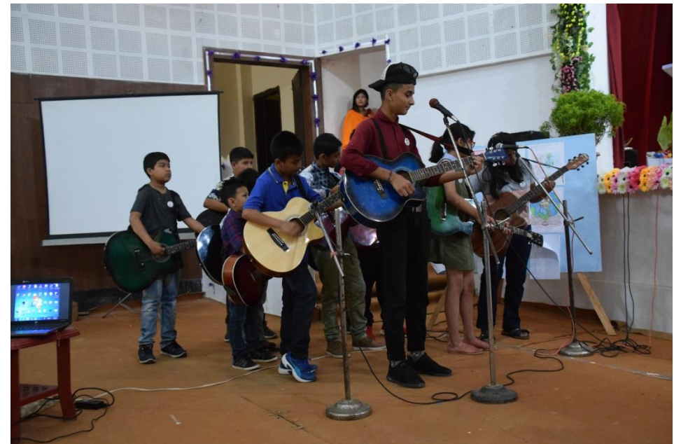
Children form Sound Wave Music School, performed songs on the theme of Biodiversity Conservation

6. Program by children : Songswere performed by school children as a part of the function.