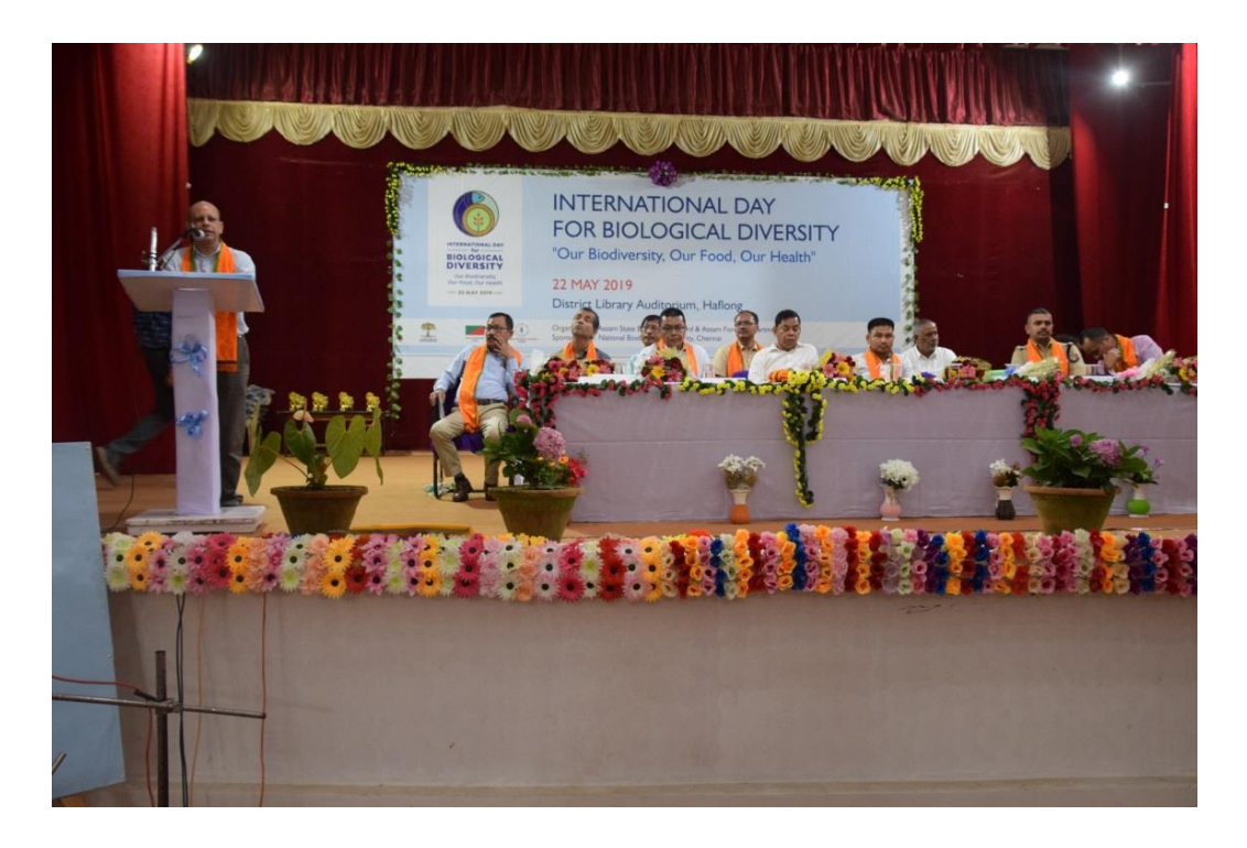
Address by Shri Amitabh Rajkhowa, Deputy Commissioner, Dima Hasao district