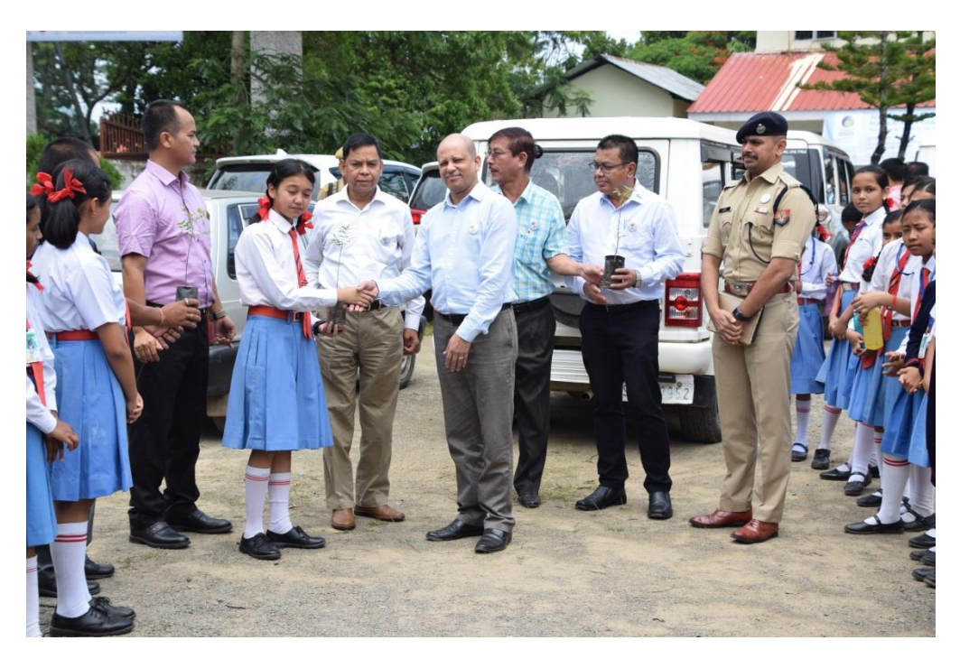
Shri Amitabh Rajkhowa, Deputy Commissioner, Dima Hasao District, during sapling distribution among students

2. Lighting of Lamp: The sapling distributing was followed by lighting of lamp. The chief guest and other presented dignitaries lightened the lamp during the event.