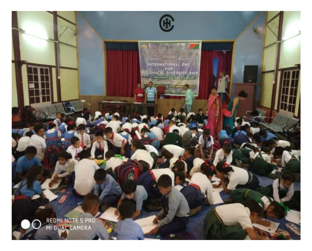
Students from various schools taking part in competitive events

As part of the celebration, for generating awareness among the school children drawing and essay writing competition were organised on 14<sup>th</sup> May, 2019 at Cultural Institute Hall, Haflong. Over 900 school children from 53 different schools of Dima Hasao district participated in the competitions.